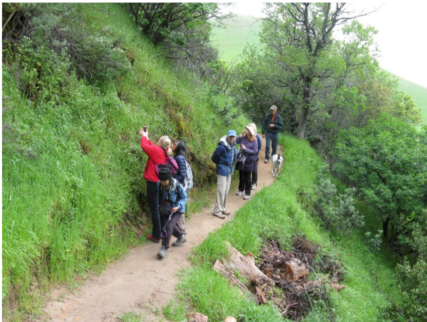
Unpaved narrow trail

Walkers, Hikers, Joggers, and the occasional horse rider should not expect to encounter a mountain bike rider on park narrow trails unless posted for bike use on a few board approved (21) trails that usually provide connections to wide multi-use trails.