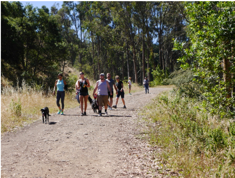
Unpaved wide multi-use trail

The District has 80 years of experience (1937 to 2017) with hiking and equestrian use in its system of trails that now include 200 unpaved narrow Park trails that were constructed for (hikers and equestrians) and currently total approximately 150 miles, mostly short in length trails that are often located in sensitive resource areas or along steep terrain. Some narrow trails are designated for (hikers only).