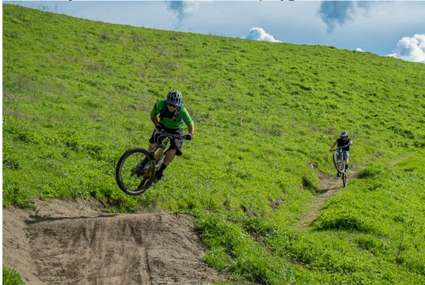
Single-track pump flow trail

“Several custom built single-track trails have been designed and constructed by the Bicycle Trails Council of the East Bay along with the architect of single-track trails, Nat Lopes of Hilride and by Sweco operator Jim Jacobsen. These trails were designed and specifically built for mountain biker riders who want a unique downhill flow experience. We not only have a new riding spot in the East Bay, but it’s a legitimate single track trails destination. Rollers, berms and even table top jumps offer options for getting rad and even take to the air. A few months ago, this was just another grassy hill in the east bay. Now it’s a mountain bike playground.”